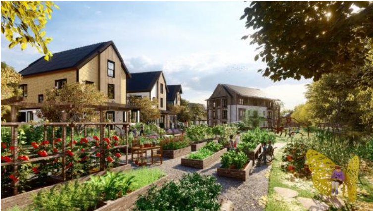
Digital rendering of residents of Veridian at County Farm at the community garden

Ann Arbor MI is getting one of the first 100% solar-powered, carbon-neutral and fossil fuel-free communities in the U.S. The idea is to pioneer the creation of neighborhoods that limit their contribution to climate change. The motivation is to build sustainability and fight climate change where the developer (who is considered one of the world's net zero energy building leaders) lives, hoping other communities will do the same. Sustainable neighborhoods like Geos Neighborhood in Arvada, Colorado, are growing in size and number in the U.S. This project is unusual because it's creating one of the nation's first mixed-income sustainable communities. Construction began in early 2022 with people expected to be moving in late this year. Sales prices are expected to be roughly